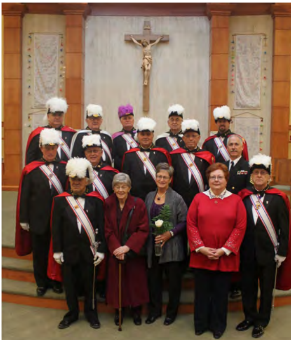
Our Honor Guard and guests at the Veterans Day Mass at St. Pius on November 13, 2011.